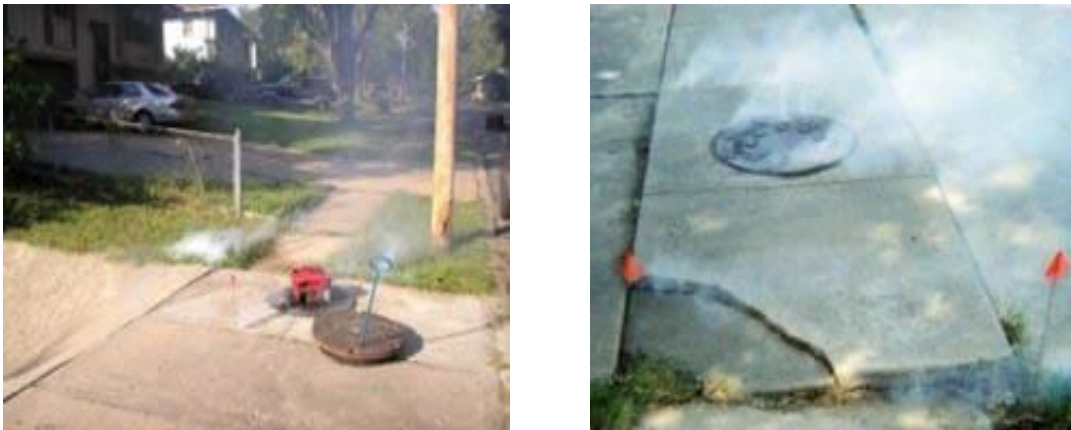
Figure 2. capacity blowers are used to pump non-toxic smoke into a manhole (left photo). In the right photo, smoke is pushed into the system and emerges from cracks in the sidewalk and at a downstream manhole.

Smoke testing is the process of injecting artificially produced smoke into a blocked off pipeline segment to see where the smoke emerges. If the sewer is in good condition then the forced smoke will emerge from manhole lids along the line and house vents on the roof. If the line has defects, the smoke will find the break and try to escape through the break.