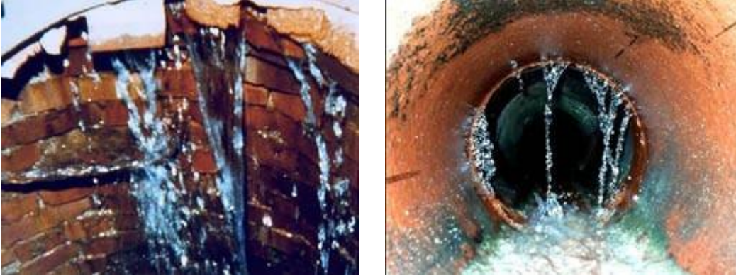
Figure 1. Storm water entering into the sewer system from a manhole, at left, and from a defect inside a pipe, at right.

Inflow such as depicted here can result in an overburdening of the sanitary sewer system, which may result in Sanitary Sewer Overflows (SSOs).