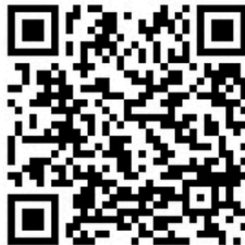
Educational Video for Public Housing Residents on the RAD Process