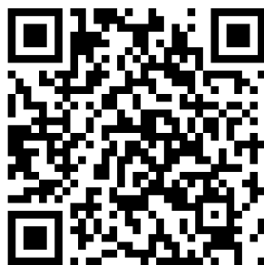
Youtube Video for Resident Meeting