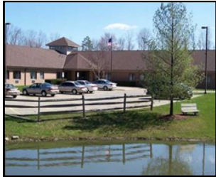
Harris House 50 Single Units Chardon Schools Chardon