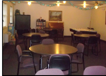
Large community room for activities and entertainment