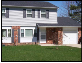
Cloverdale Estates 49 Family Units Cardinal Schools Middlefield