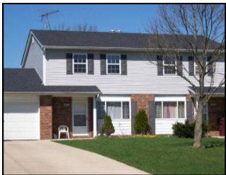
Scranton Woods 38 family Units Newbury Schools Newbury