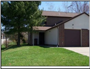
Strickland Arms 30 Family Units Kenston Schools Bainbridge