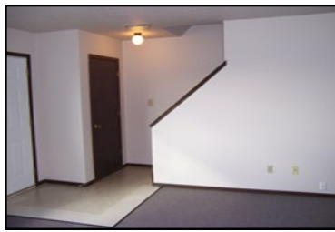
Enjoy an open floor plan