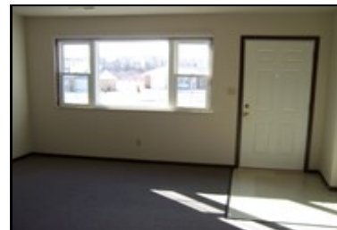
Bathrooms are recently updated