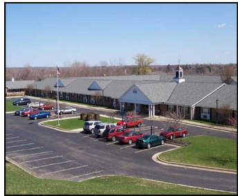
Murray Manor 76 Single Bedroom Units Chardon Schools Chardon