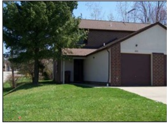
Strickland Arms 30 2 & 3 Bedroom Units Kenston Schools Bainbridge