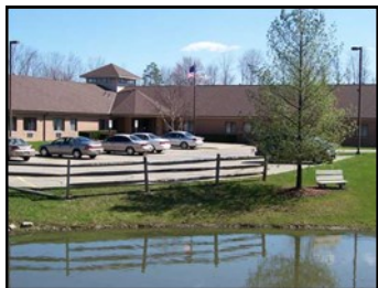
Harris House 50 Single Bedroom Units Chardon Schools Chardon